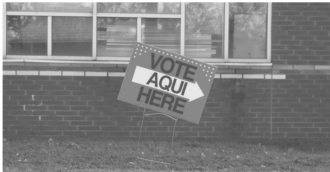
The city's Independent Party failed to win a single seat this election.