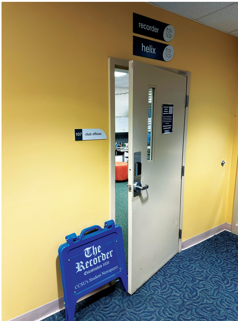
Pictured is The Recorder's Office in the Student Center